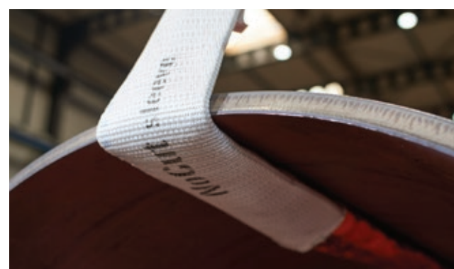
SpanSet NoCut® sleeve – the textile protection sleeve.

...protect the MagnumForce Green against sharp edges. The MagnumForce combinations with NoCut or secutex protection sleeves have been tested on the sharpest radii under load.